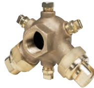
5880-3/4 NPT Female Back inlet connection.

W = Maximum effective coverage with nozzle mounted at 36" height.