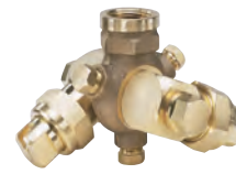
Type 4418-3/4-2TOC Double Swivel with 3/4" NPT (F) pipe connection. Brass.