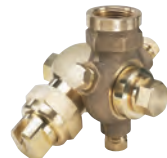
Type 4629-3/4-TOC Single Swivel with 3/4" NPT (F) pipe connection. Brass.