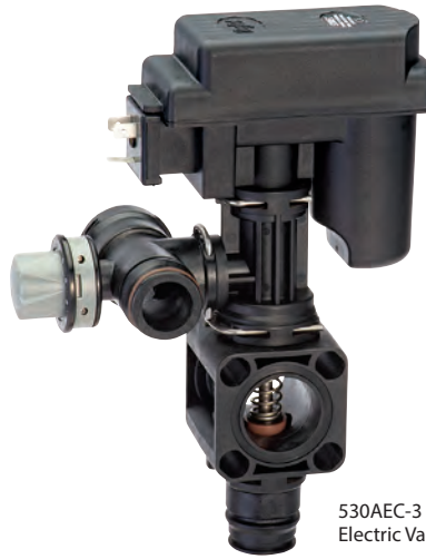
530AEC-3 Electric Valve