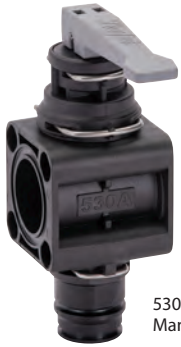
530AM-2 Manual Valve