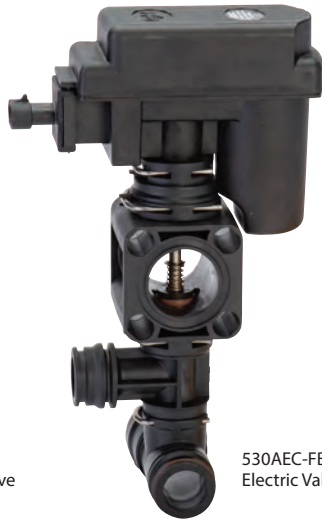
530AEC-FB Electric Valve