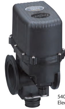
540 EC Electric Valve