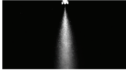
Dense spray pattern of medium to fine droplets provides superior coverage.