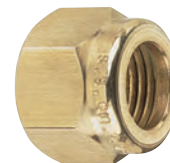
CP20230 TeeJet Cap

*Use CP20229-NY gasket when 4514-NY Nylon slotted strainer is not used.