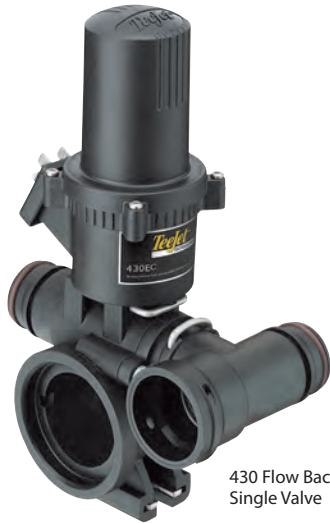
430 Flow Back Single Valve