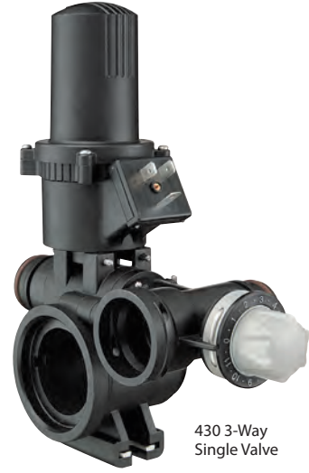
430 3-Way Single Valve