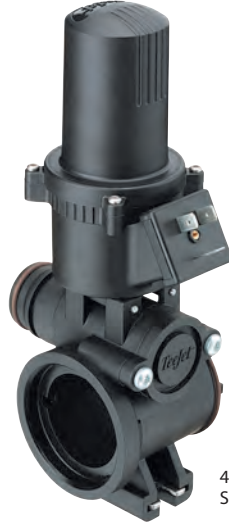
430 2-Way Single Valve